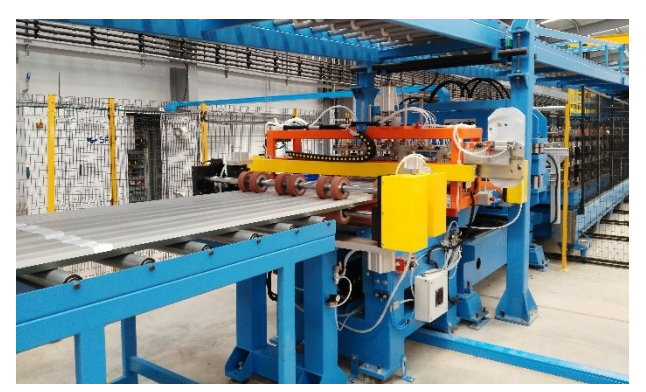
High automation level of the metal sheet joining

A newly conceived wall panel now in production.